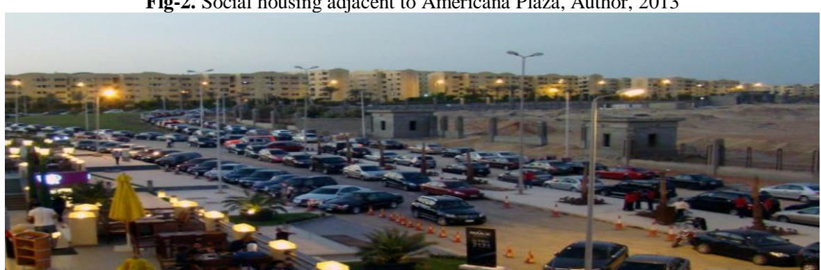
Fig-2. Social housing adjacent to Americana Plaza, Author, 2013

Like many new projects in the new developments around Cairo, the immediate context of Americana Plaza as well as Arkan is mostly under construction or vacant lands waiting for promised developments as seen is Fig.2 and 3. The only attractions remain the adjacent Tivoli Dome, and the nearby hyper market, 'Hyper One', which is one of the major shopping venues for the 6<sup>th</sup> of October city. Paradoxically facing Americana Plaza on the other side of the street is the Sheikh Zayed communal Housing project as shown in Fig.2, where lower middle income groups reside, yet, with a low capacity of use rate.