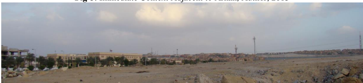
Fig-3. Immediate Context Adjacent to Arkan, Author, 2013