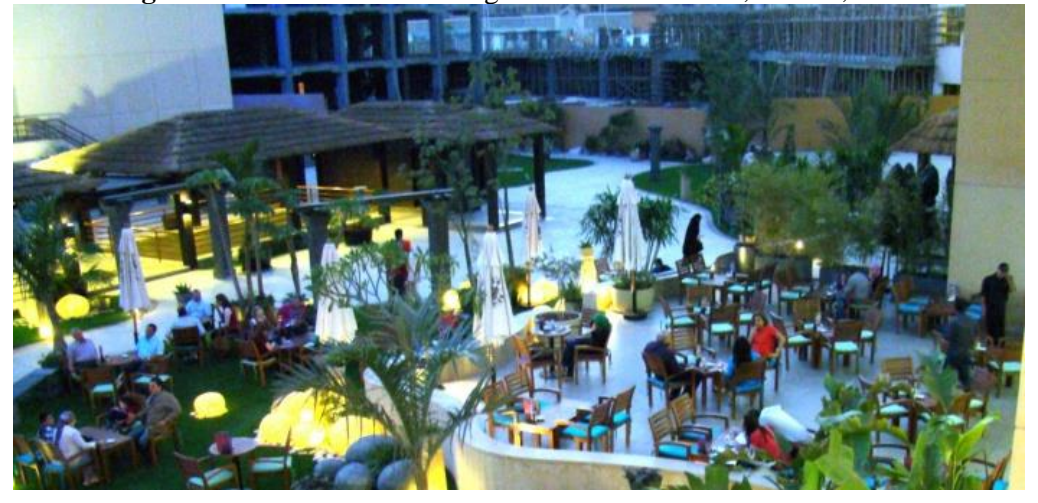
Fig-8. Isolated islands of seating areas for each outlet, Author, 2013.

As to the socio-spatial implications of this new practice of open space, observations led to the fact that no cultural activities or social interaction between the users occur as seen in Fig.8-11. This is a result of the specific boundaries set for each food outlet, with no activities in the intermediate space, in addition to the lack of general activities which encourage the isolated groups visiting to interact.