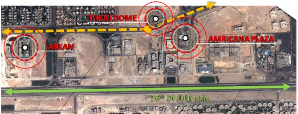
Fig-1. Layout of series of new public space in Sheikh Zayed, Author, 2014

A pattern which recently emerged in new developments around Cairo is the new form of 'public space', open to the entire public, yet, dominated by private domain. An example for this is the series of public space spots parallel to the 26th of July Axis connecting 6th of October city to Giza. Those public space series belonging to Arkan Mall, followed by that of 'Americana Plaza' then 'Tivoli Dome', and the pending 'Raya Plaza', as shown in Fig.1 all represent the new trend by private investors to attract the bored residents of the new district by providing new outing spaces other than the controlled, privatize space of the shopping malls.